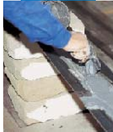
Application of Adesilex PG1 on metal sheet