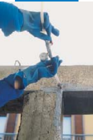
Column clad with Adesilex PG1