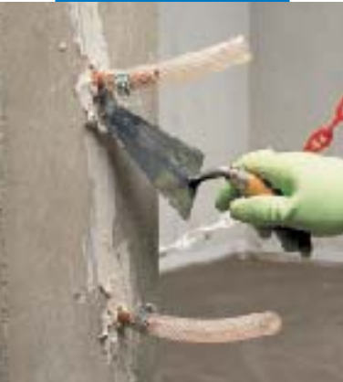
Fixing injection tubes and sealing cracks for structural consolidation