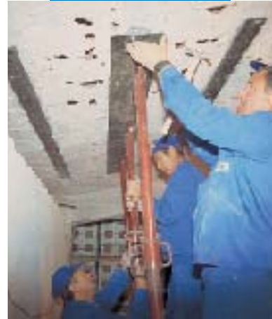
Placing metal sheet for structural reinforcement