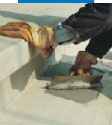
Application of Adesilex PG1 with a notched trowel for structural bonding of pre-fabricated steps

Adesilex PG2 , special care must be taken for the preparation of surfaces to be bonded. The concrete, natural stone or brick substrate must be clean, solid and dry. Sand-blasting is ideal to remove all loose and crumbling parts, efflorescence, cement laitance and traces of form-release oils. Then remove all dust with compressed air. All traces of rust, paint and oil must be removed from metal surfaces, preferably by means of sand-blasting (SA 2 1/2) down to bright metal.